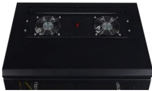
AR8213 Fan tray