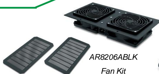
AR8206ABLK Fan Kit